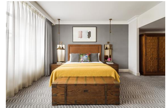
270 Loft-Style Bedrooms, Complimentary WIFI, Smart TV's, Tea and Coffee Facilities, Tuck Box complimentary Treats, Mini Fridge, Virtual Newsagent, Yoga Matt and Umbrella