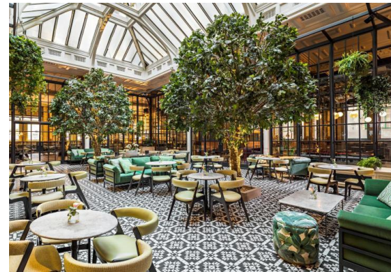
The Refuge - A Manchester Restaurant With Vibe