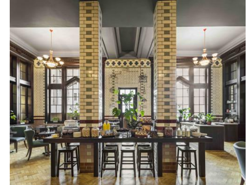
The Post Room Clock Tower Meeting Room Break- Out Space.