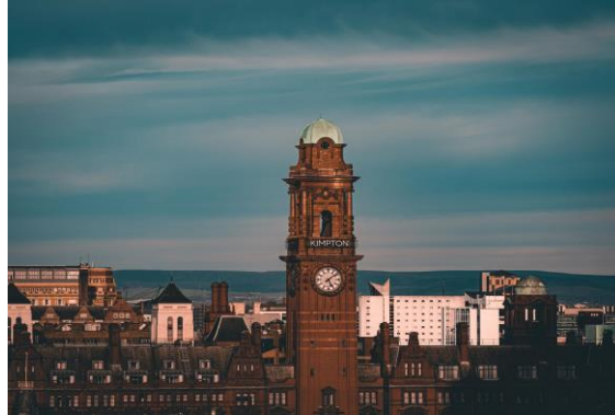
City Centre Location 8 Miles From Manchester Airport Opposite Oxford Road Station

Please email: manchesterconference@ihg.com